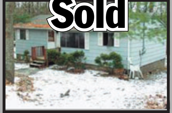
Sold for Chase Bank