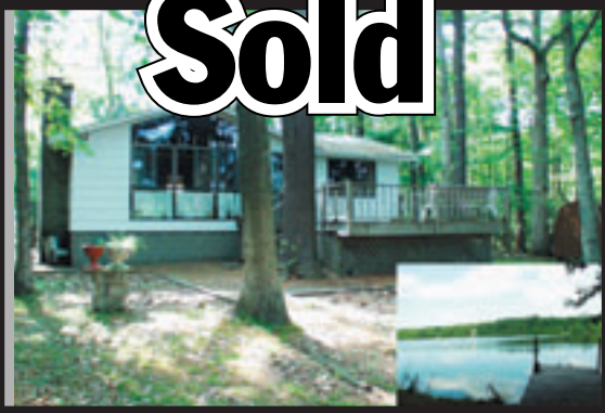
Sold for Steinbergs