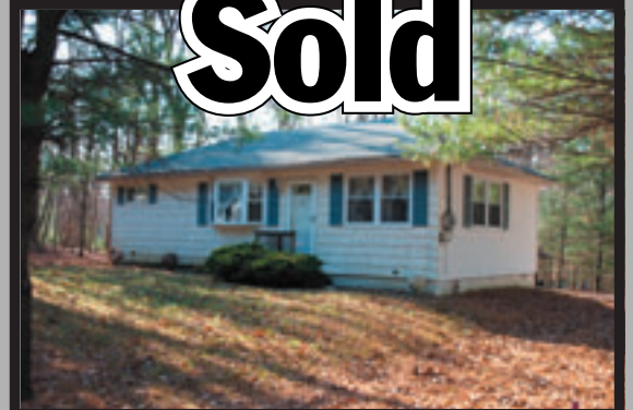
Pending for the Dwyers

TASHLIK REAL ESTATE www.tashlik.com 800-634-5964