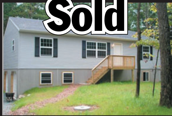
Sold for Giovanni & Sons