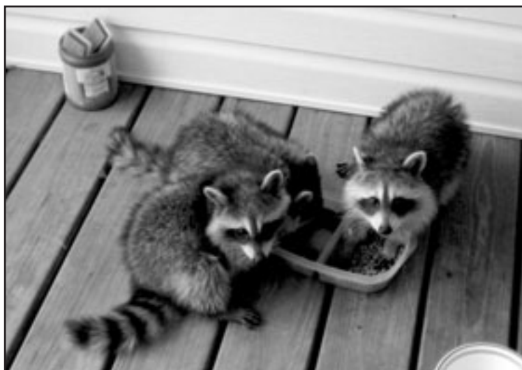
Cat food is delicious!