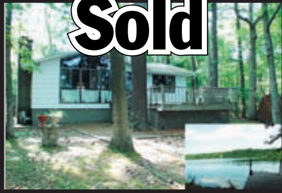
Sold for Steinbergs