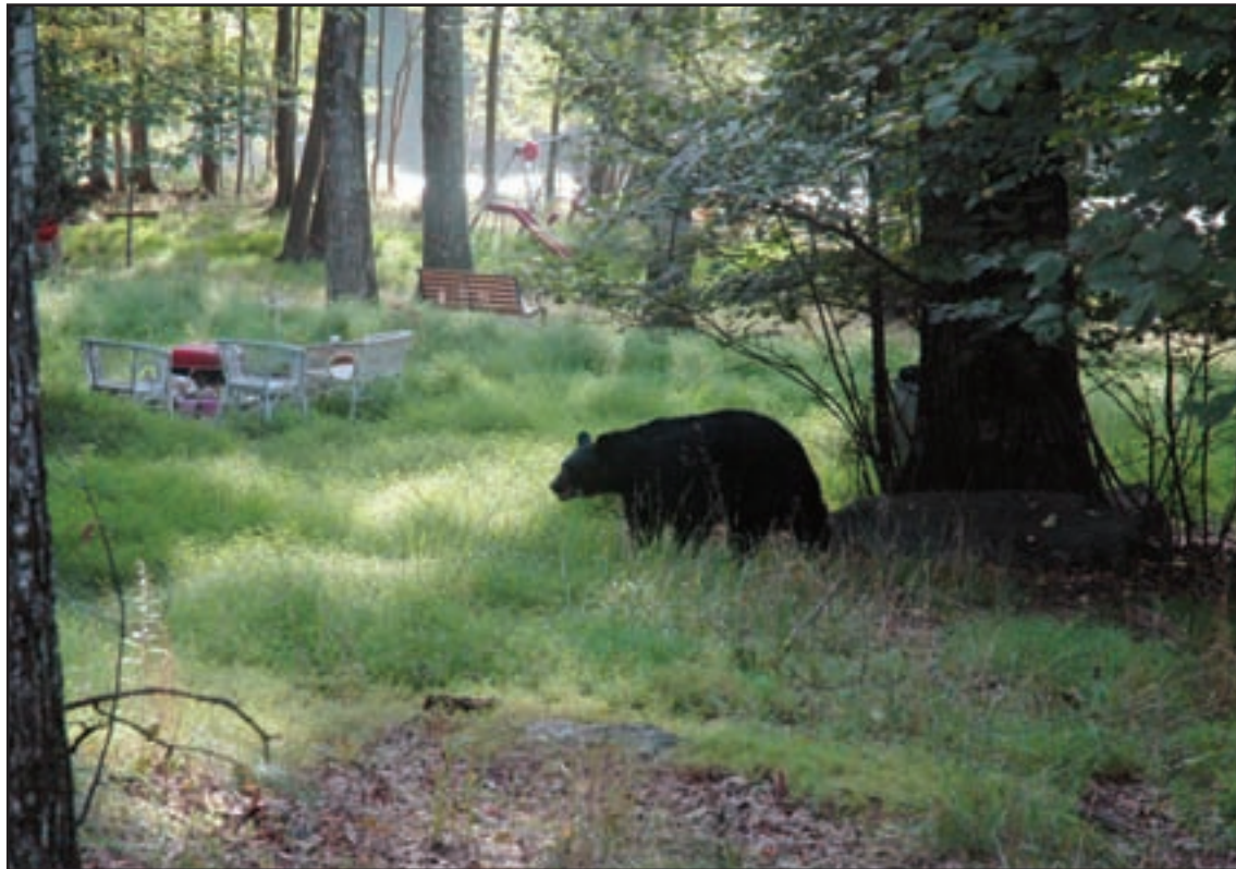
Here for a visit.