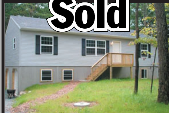
Sold for Giovanni & Sons