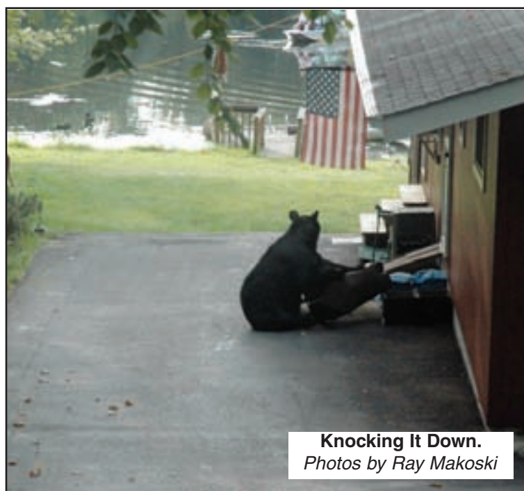
Knocking It Down.