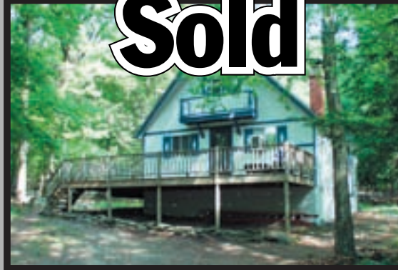
Sold for the Tashliks