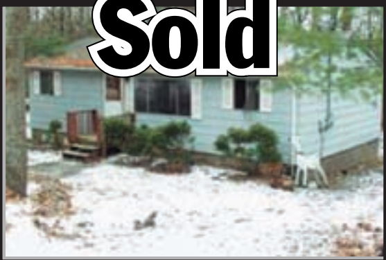
Sold for Chase Bank