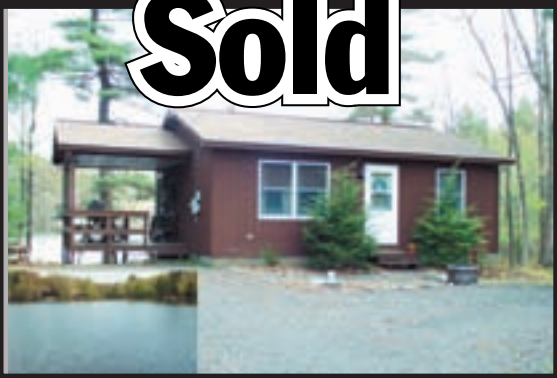
Sold for the Moultons