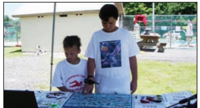
Learning about fishing.