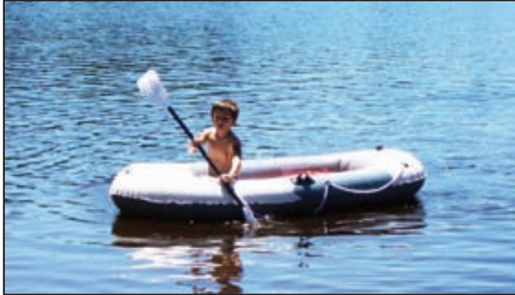
Boating on E. Lake.