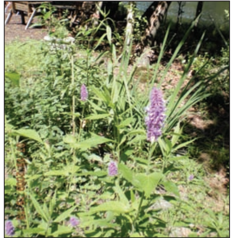
Deer resistant Hyssop.

If you want to have garden with a variety of plants that may not all be deer resistant, the only way to do that here is to fence in all or part of your property. Deer can jump high so a fence that is 10 feet high is recommended for the job. My own garden is fenced in