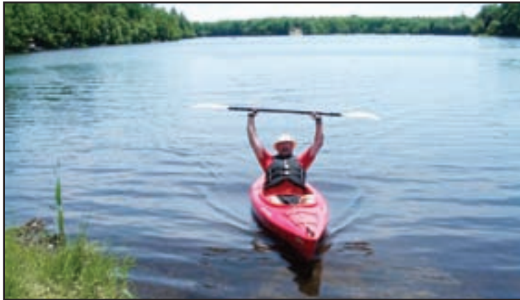
Kyack race winner.