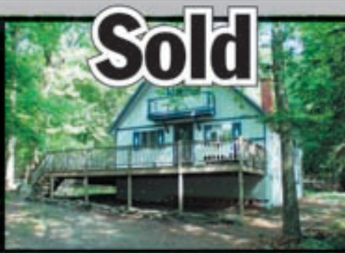
Sold for the Tashliks