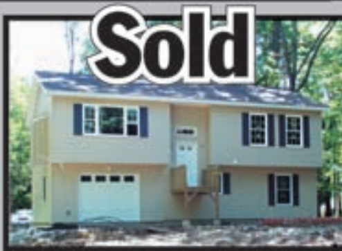
Sold for Eustace & Lane