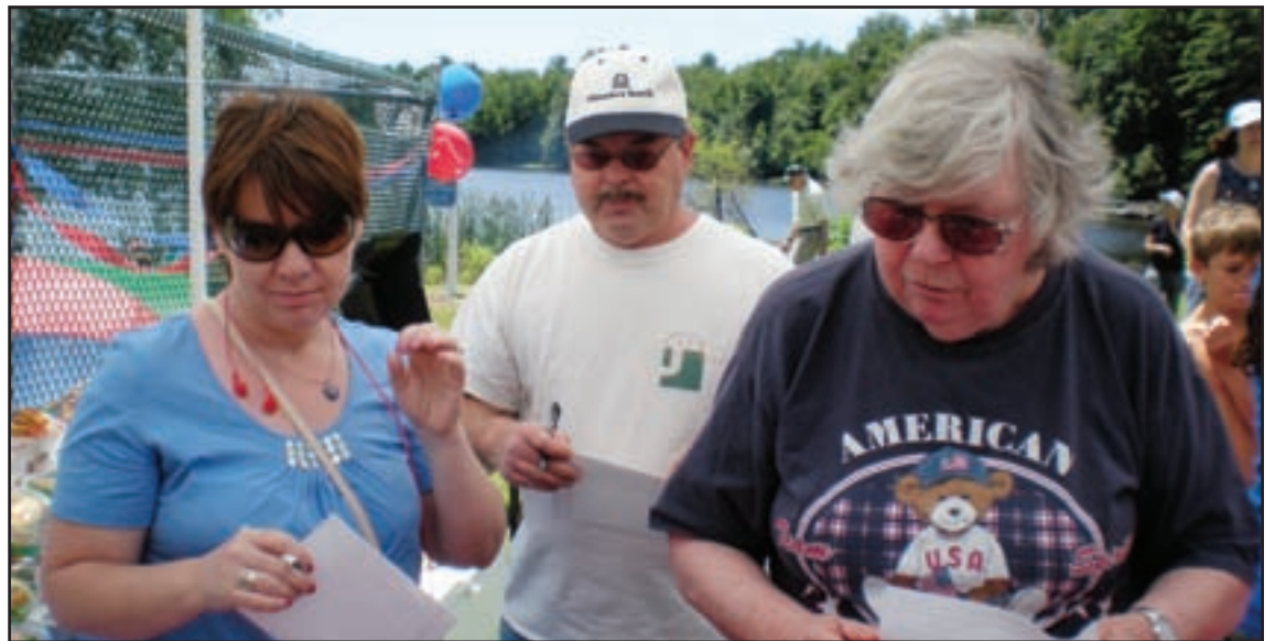
Judging the Chili-Cook-off.