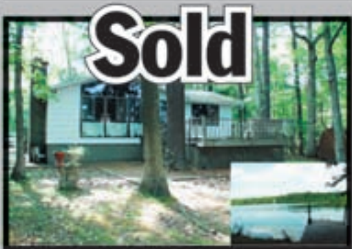
Sold for Steinbergs