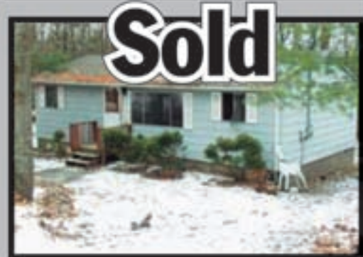
Sold for Chase Bank