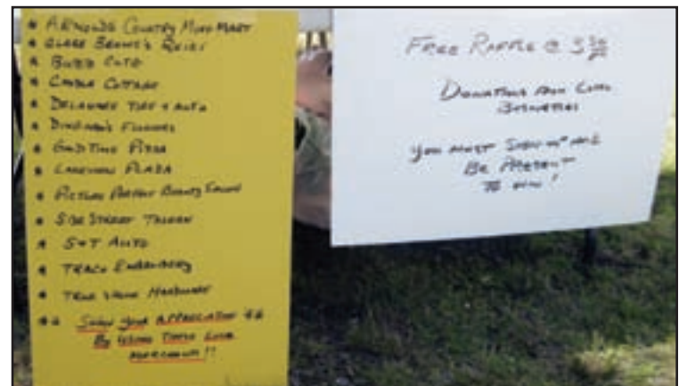
Support our local businesses.