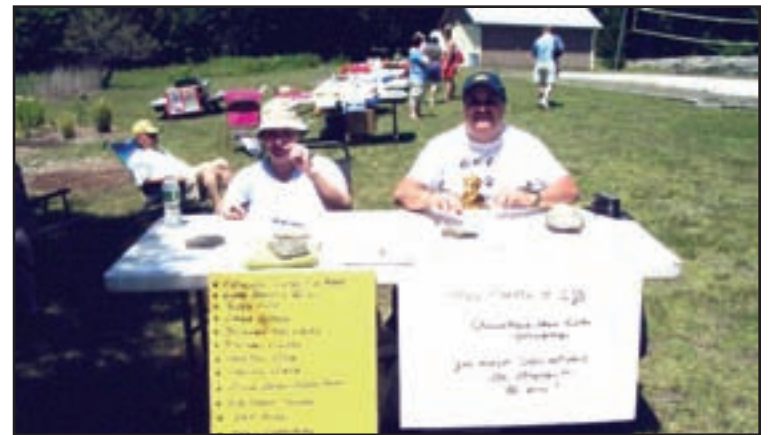
The Askars - Get Your Raffle Tickets.