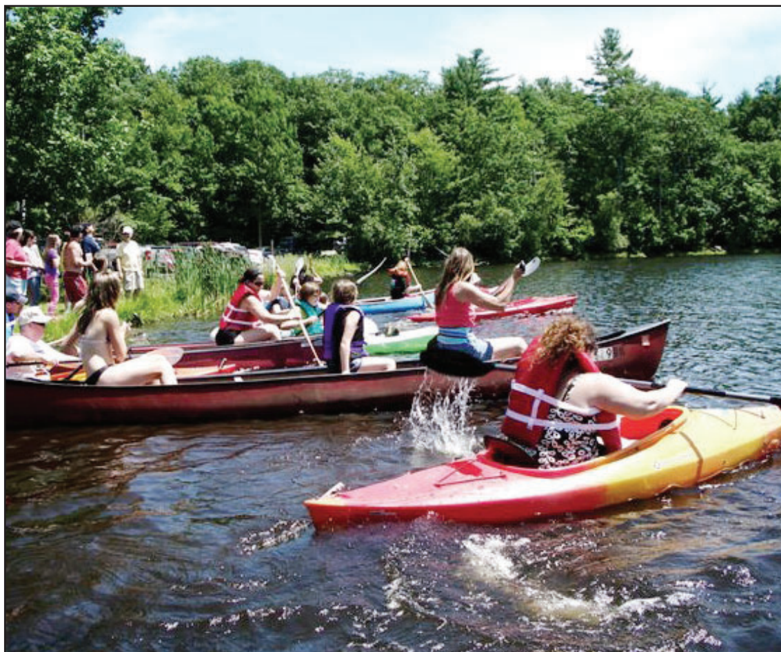
Racers at Lakefest.

I'm going to end this message by mentioning the great community-wide turn-out that we had at the 2nd Annual LakeFest and Pool Party on July 5. Parking spaces were at a premium, the weather was great, and our lifeguards and volunteers from the Recreation and Lake Management Committees did a terrific job! Some highlights included: