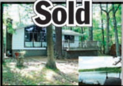
Sold for Steinbergs