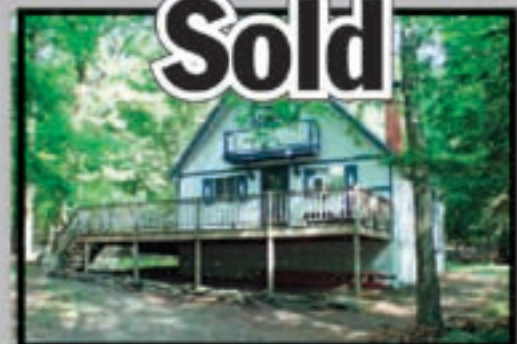
Sold for the Tashliks