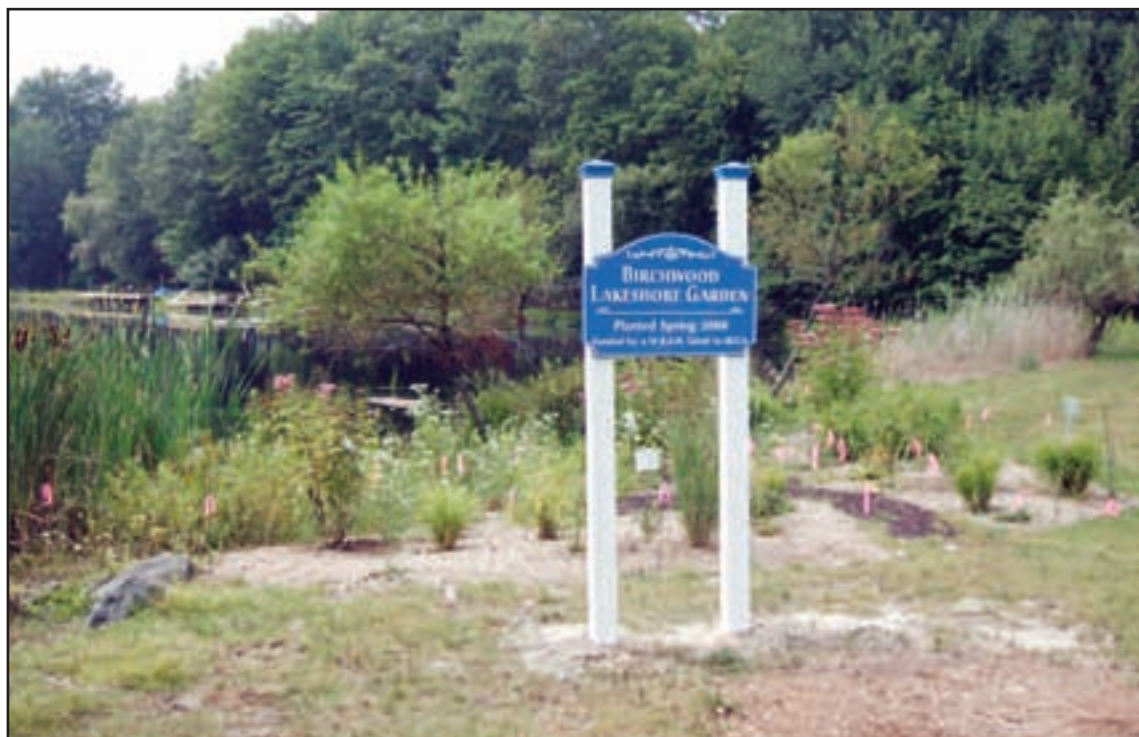
Sign put up for the Birchwood Lakeshore Garden.

One of these goals is to complete the transition from our internal book-keeping process to one that uses an outside management company. We are doing this for two reasons. The first is to make the process of billing, collections, etc more efficient and