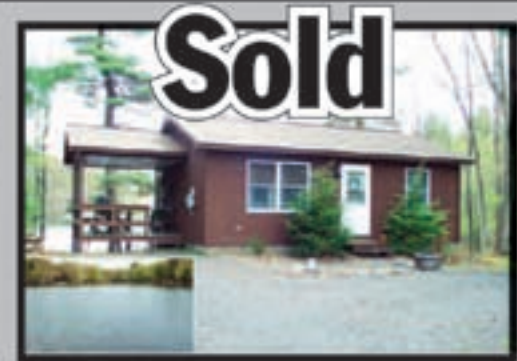
Sold for the Moultons